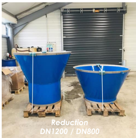
Reduction DN1200 / DN800