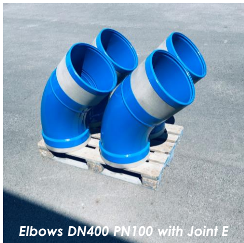
Elbows DN400 PN100 with Joint E