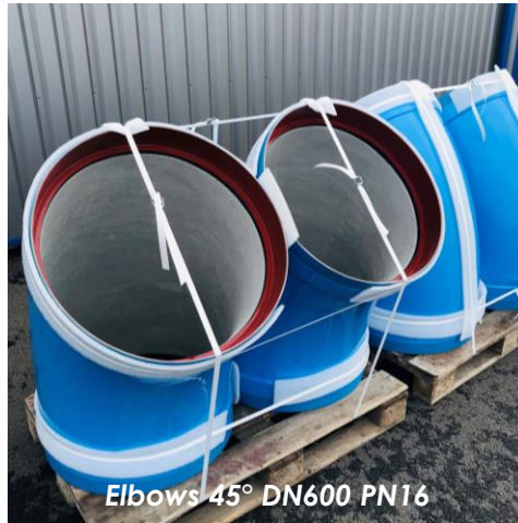
Elbows 45° DN600 PN16