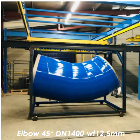
Elbow 45° DN1400 wt12.5mm