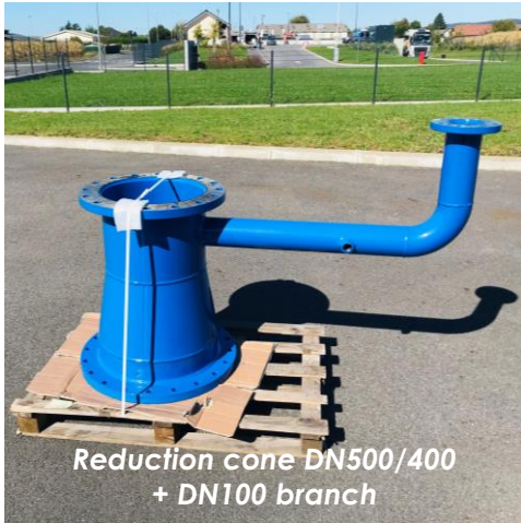
Reduction cone DN500/400 + DN100 branch