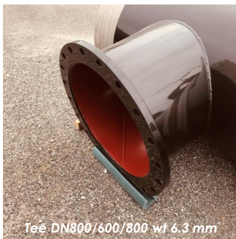
Tee DN800/600/800 wt 6.3 mm