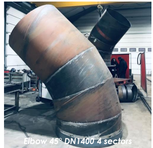
Elbow 45° DN1400 4 sectors