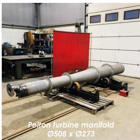
Pelton turbine manifold Ø508 x Ø273