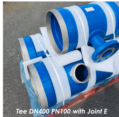
Tee DN400 PN100 with Joint E