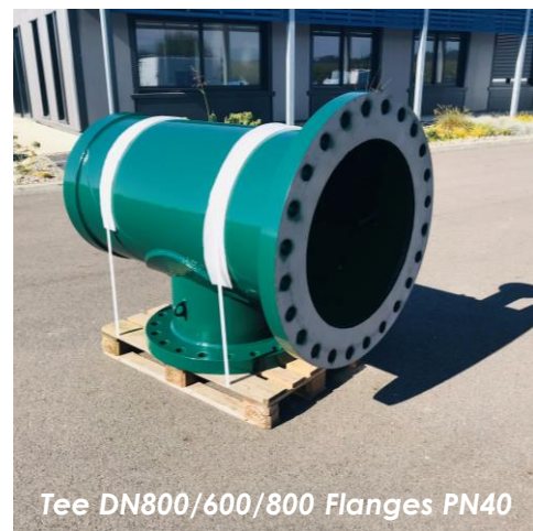
Tee DN800/600/800 Flanges PN40