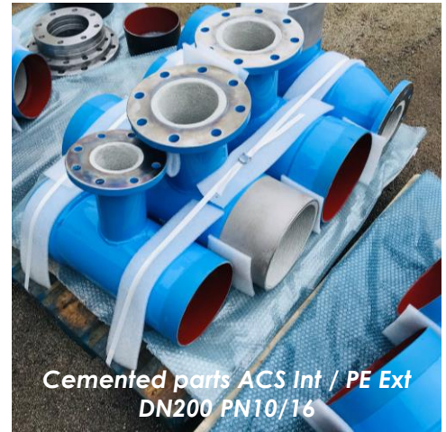
Cemented parts ACS Int / PE Ext DN200 PN10/16