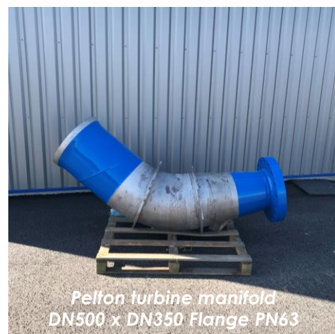
Pelton turbine manifold DN500 x DN350 Flange PN63