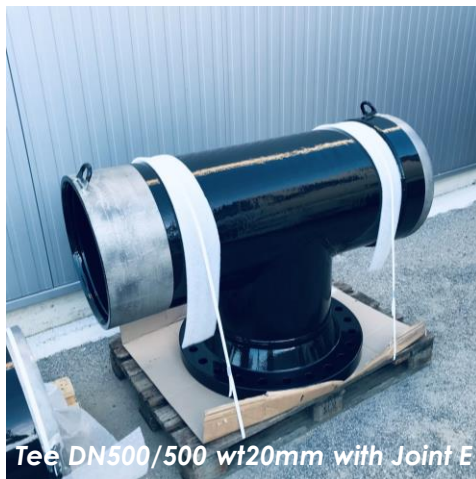
Tee DN500/500 wt20mm with Joint E