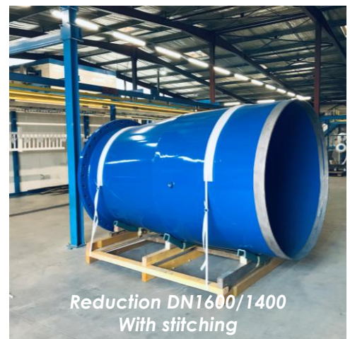
Reduction DN1600/1400 With stitching