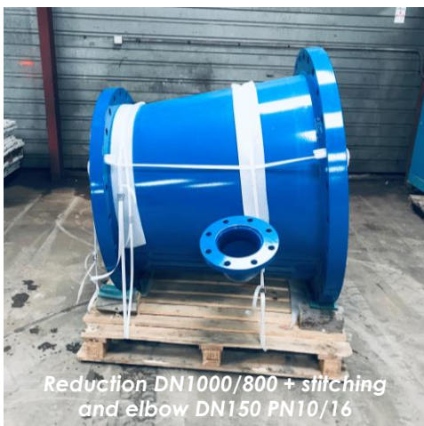
Reduction DN1000/800 + stitching and elbow DN150 PN10/16