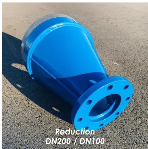
Reduction DN200 / DN100