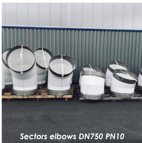
Sectors elbows DN750 PN10