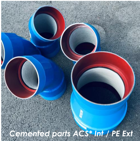
Cemented parts ACS* Int / PE Ext