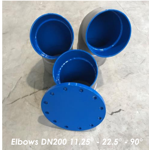
Elbows DN200 11.25° - 22.5° - 90°