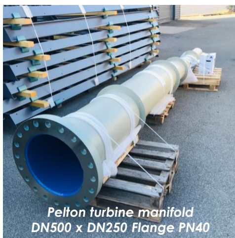
Pelton turbine manifold DN500 x DN250 Flange PN40