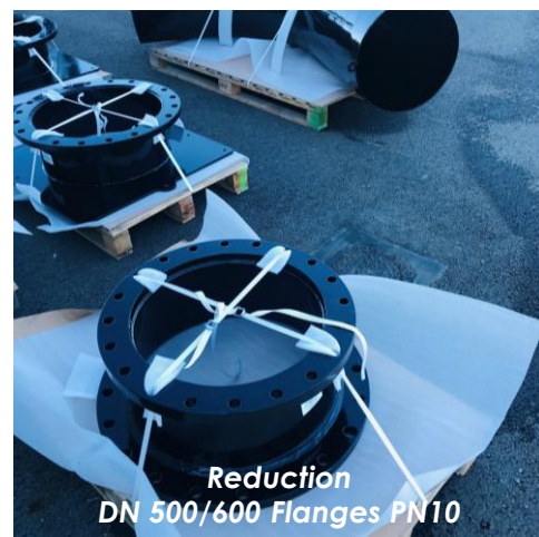
Reduction DN 500/600 Flanges PN10